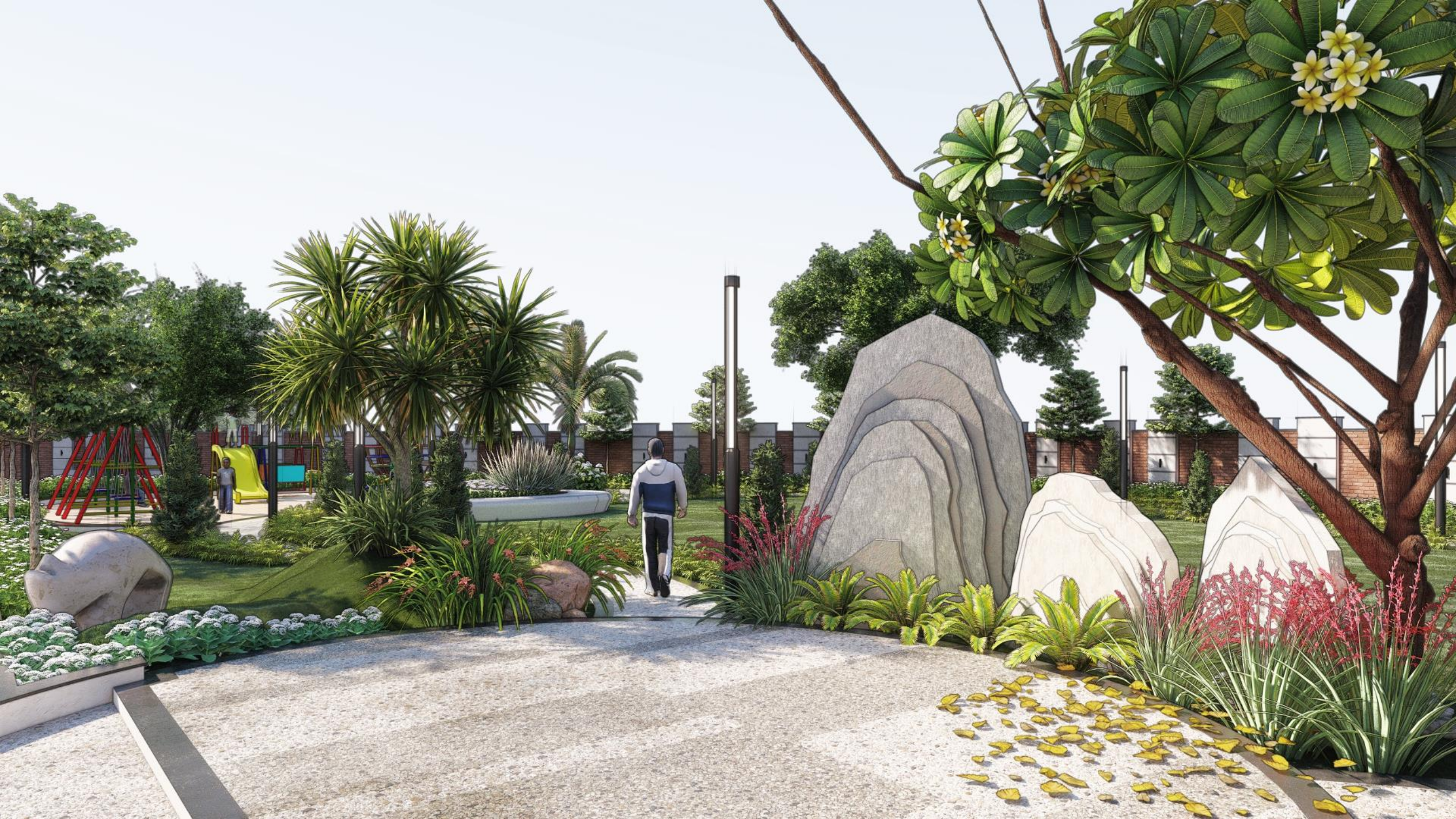
GARDEN 1 VIEW 3