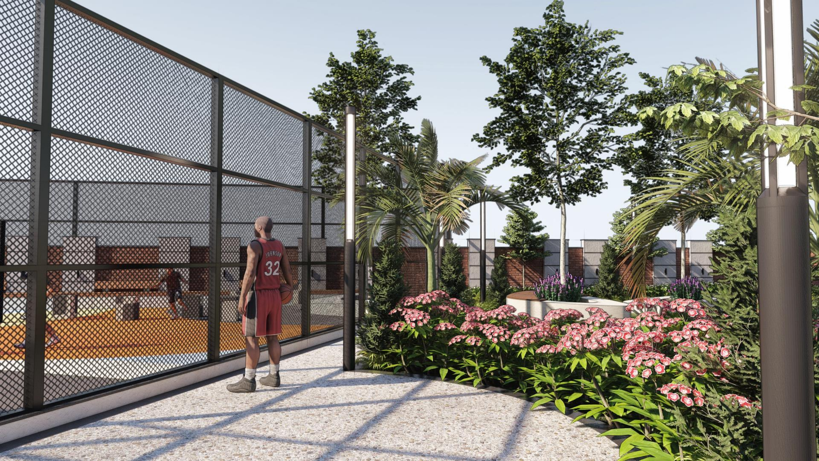
GARDEN 2 VIEW 8