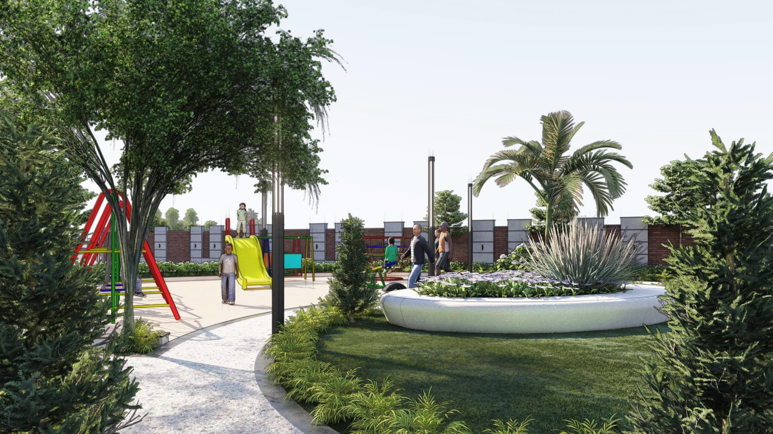
GARDEN 1 VIEW 5