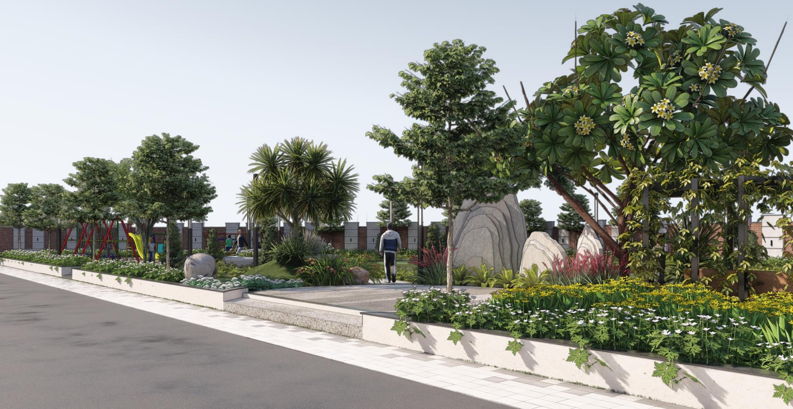
GARDEN 1 VIEW 2 (Entrance)