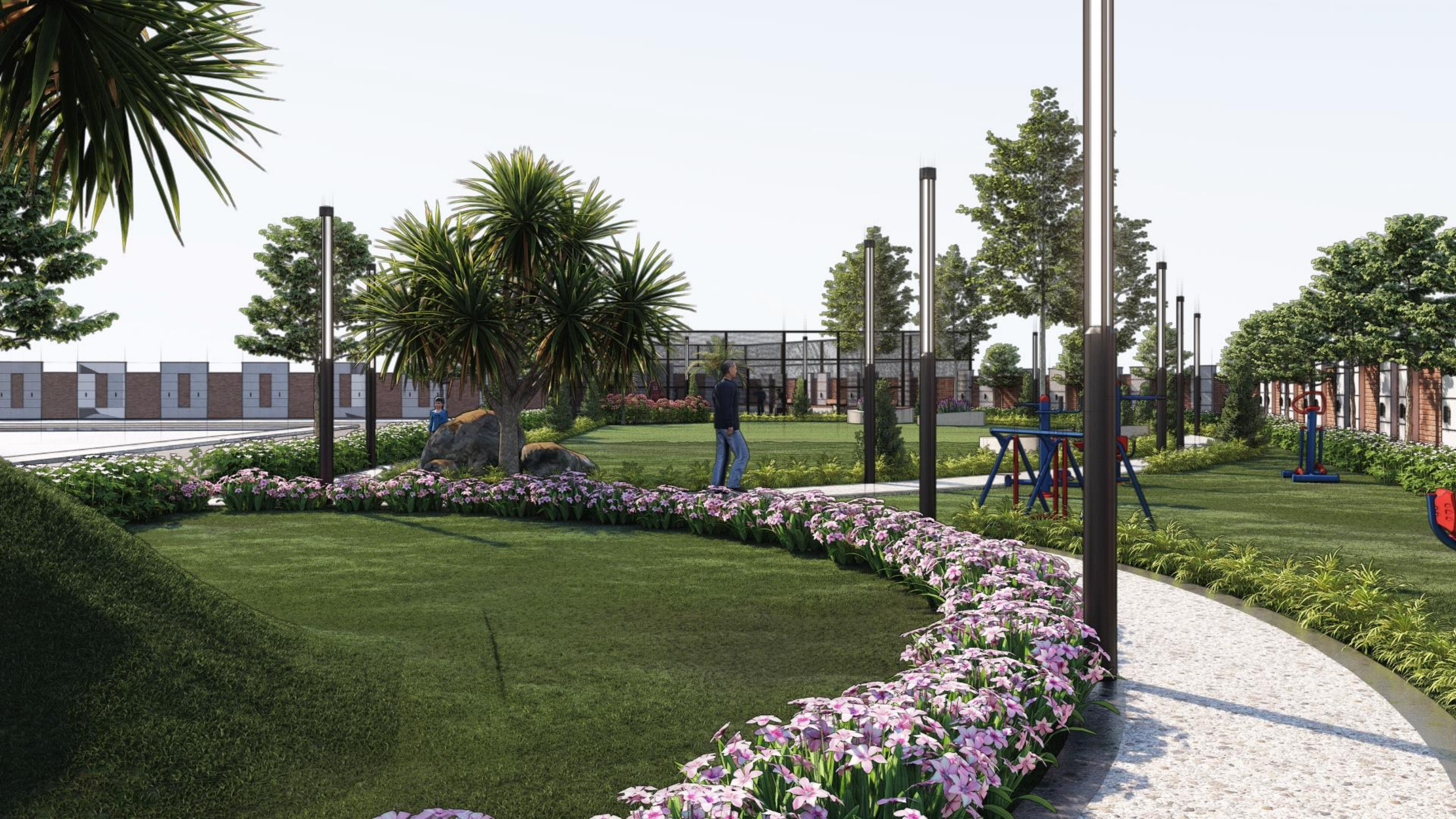
GARDEN 2 VIEW 4