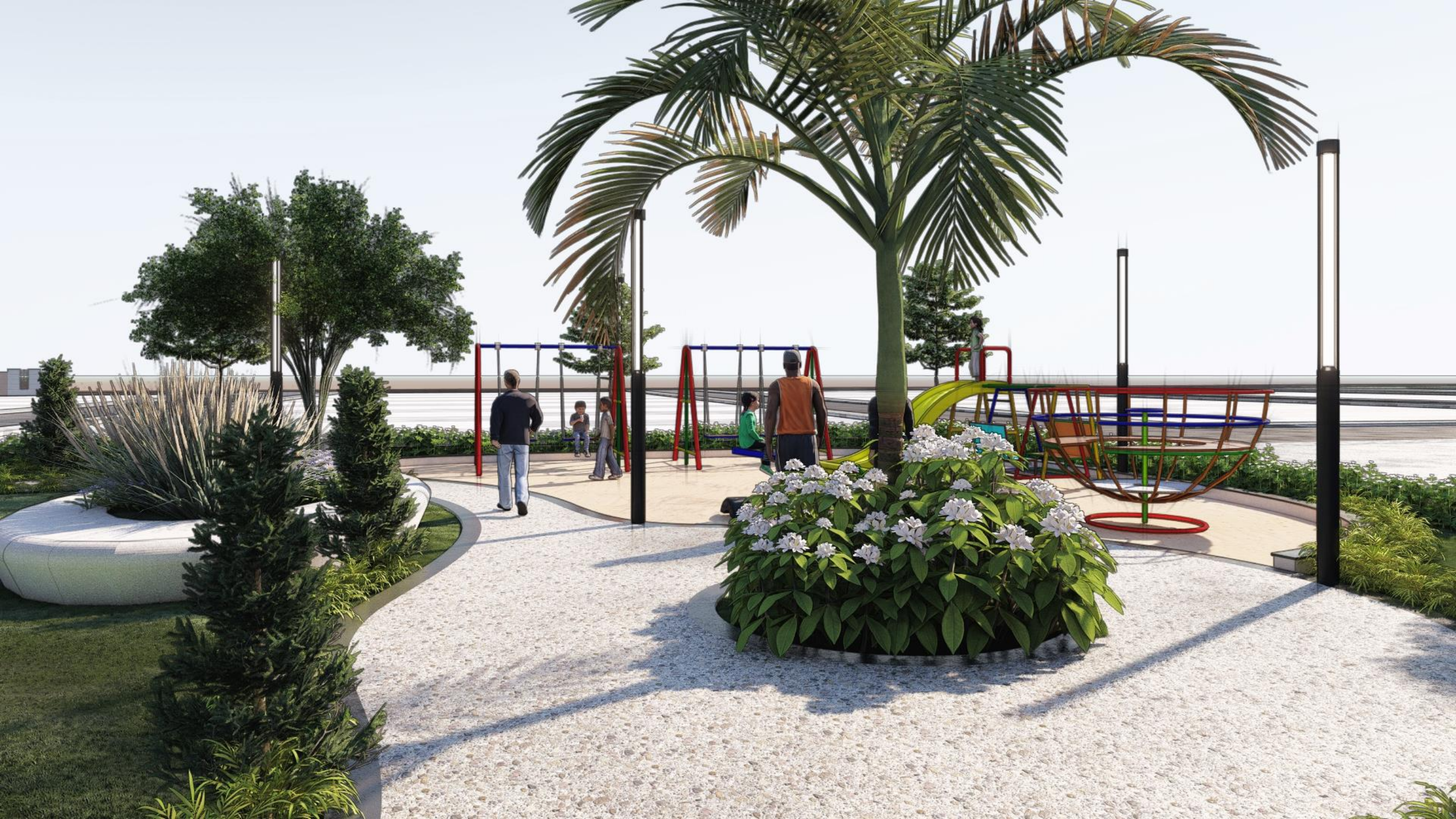
GARDEN 1 VIEW 6