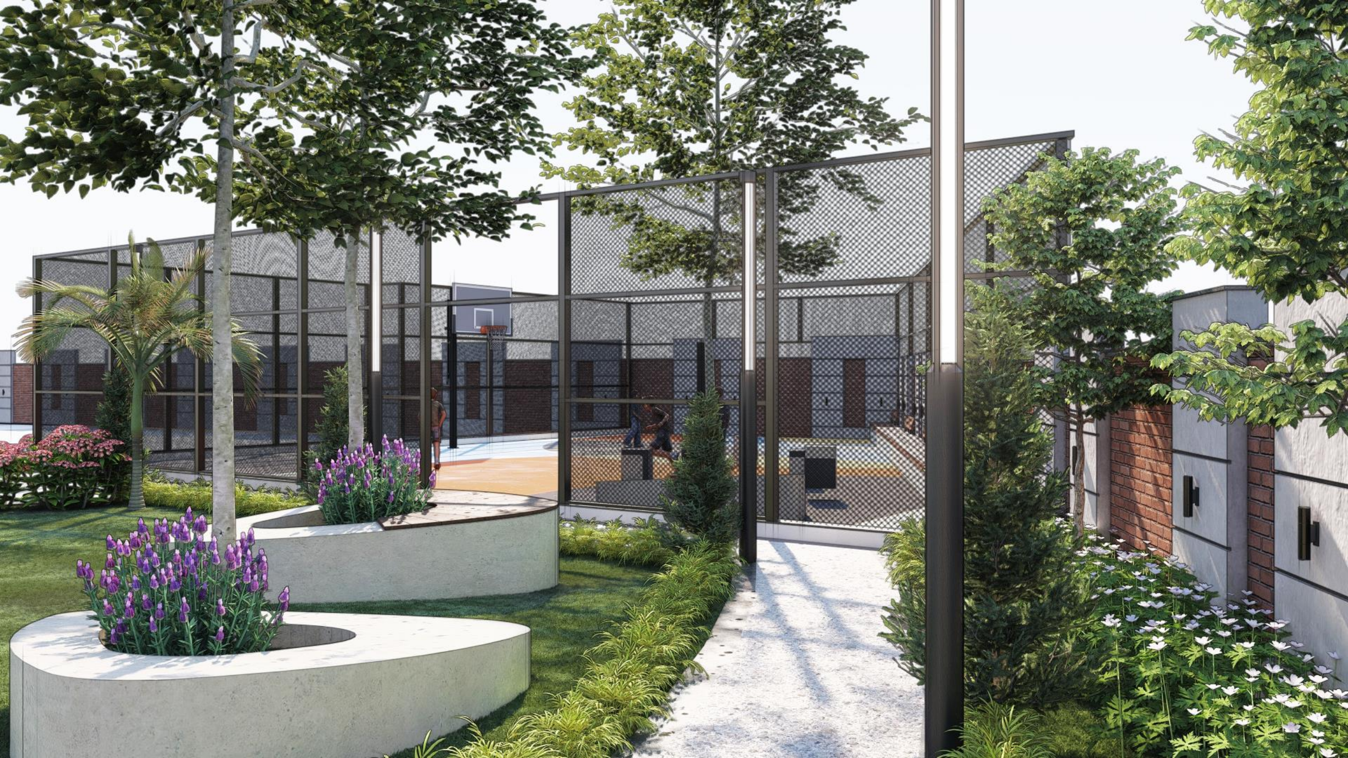
GARDEN 2 VIEW 6