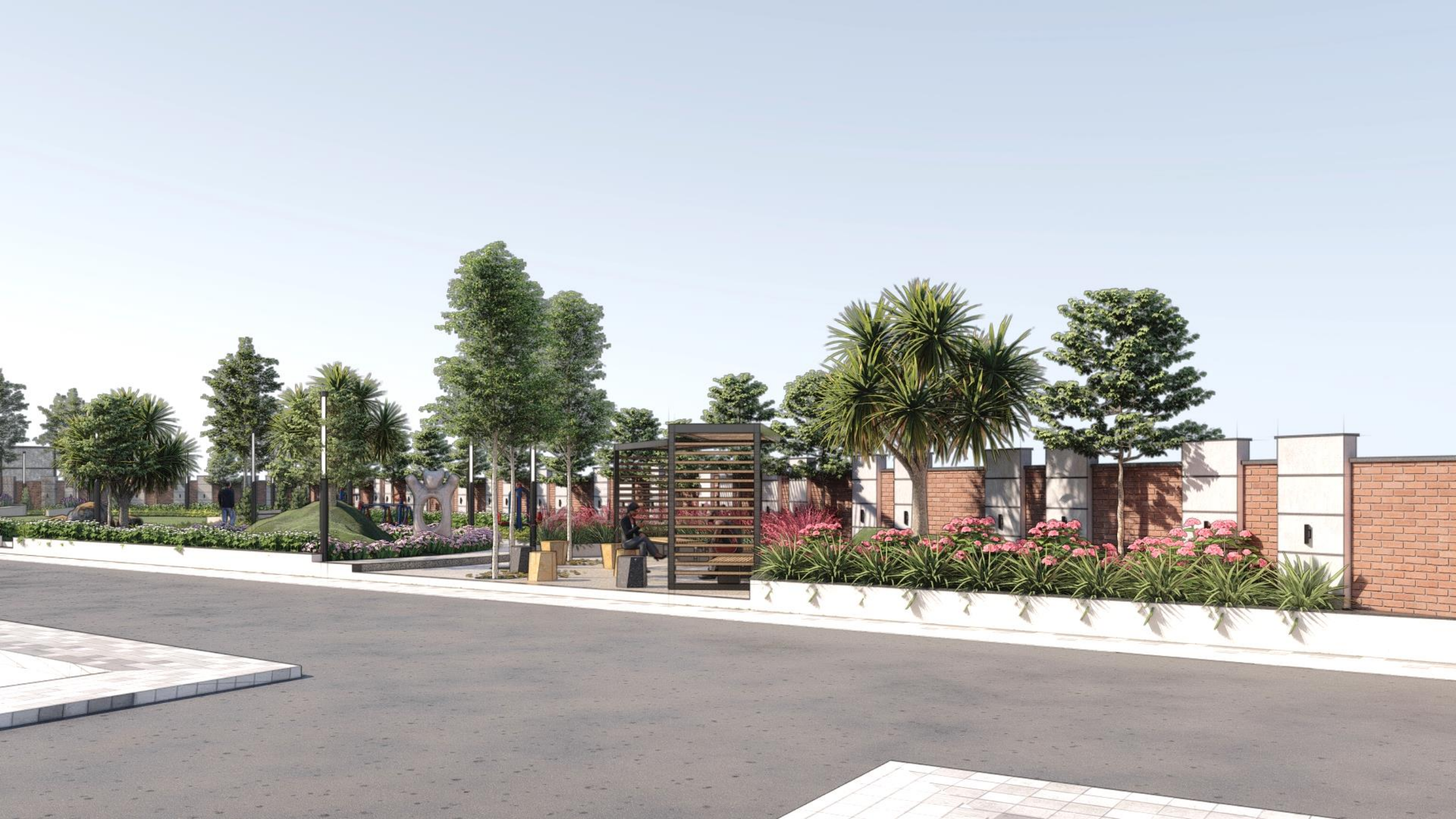
GARDEN 2 VIEW 1 (AS SEEN FROM ROAD)