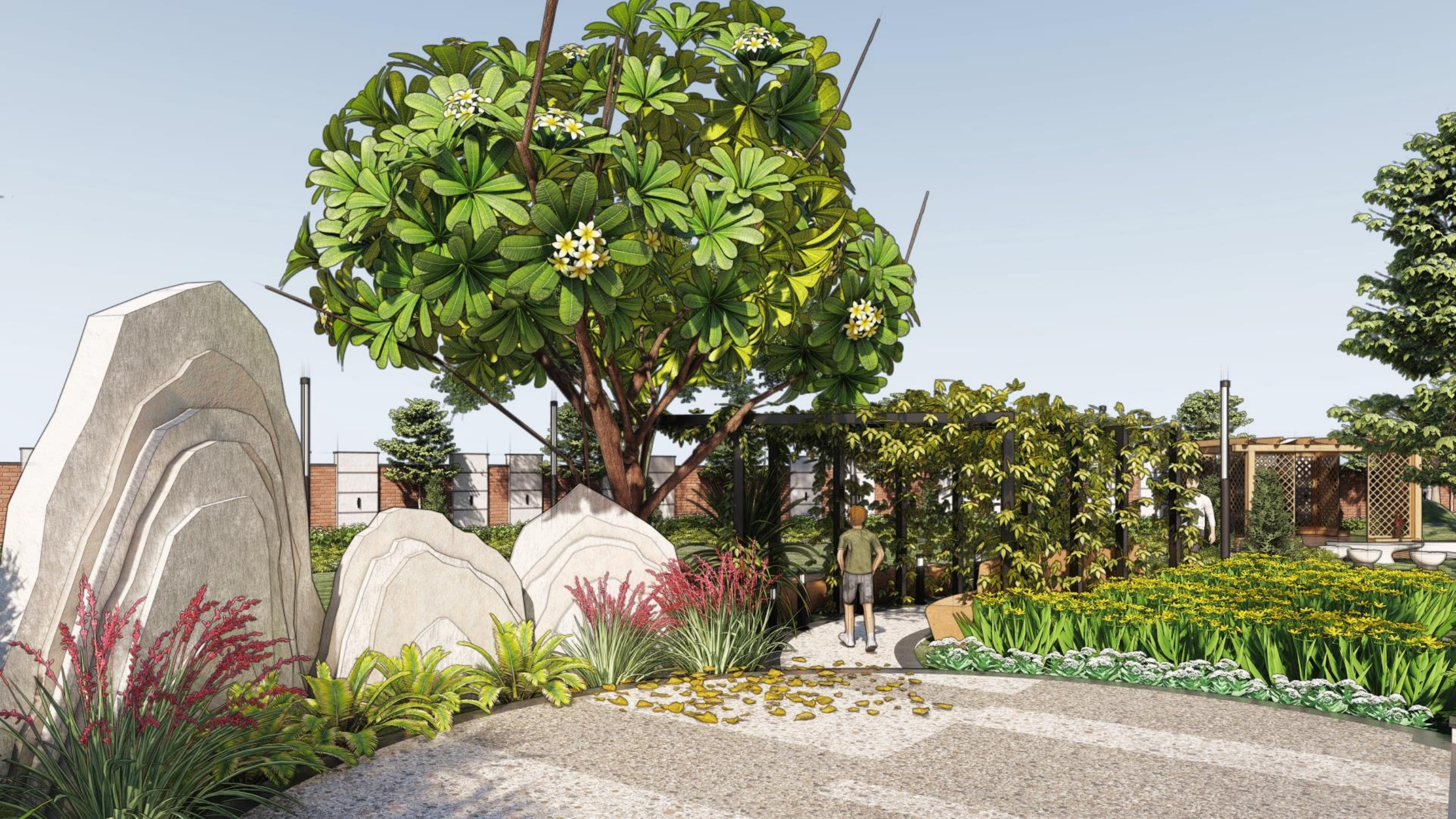
GARDEN 1 VIEW 4