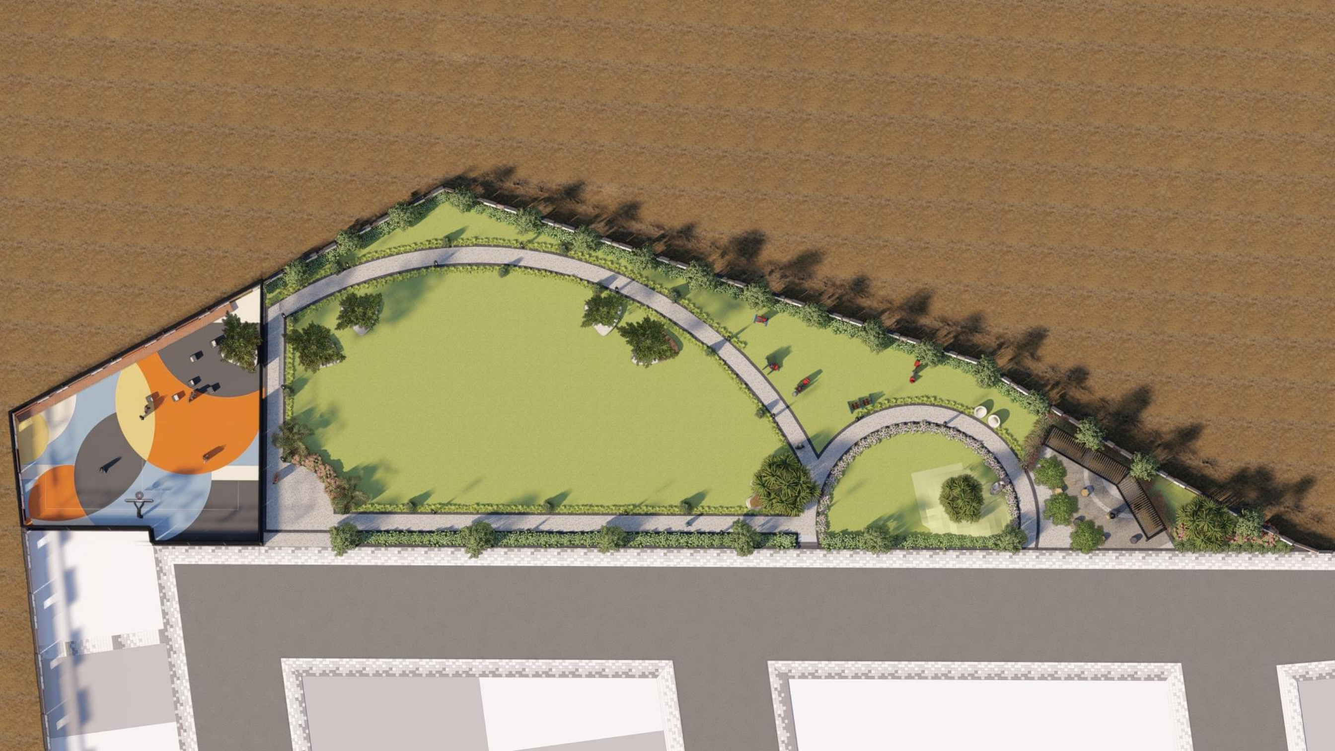
GARDEN 2 PLAN