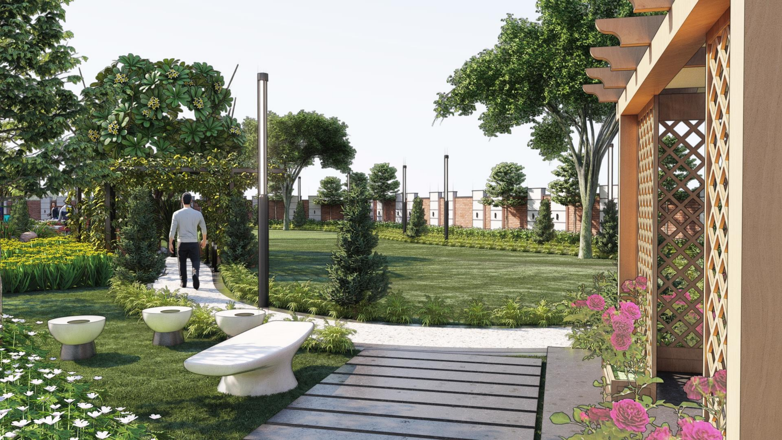
GARDEN 1 VIEW 8