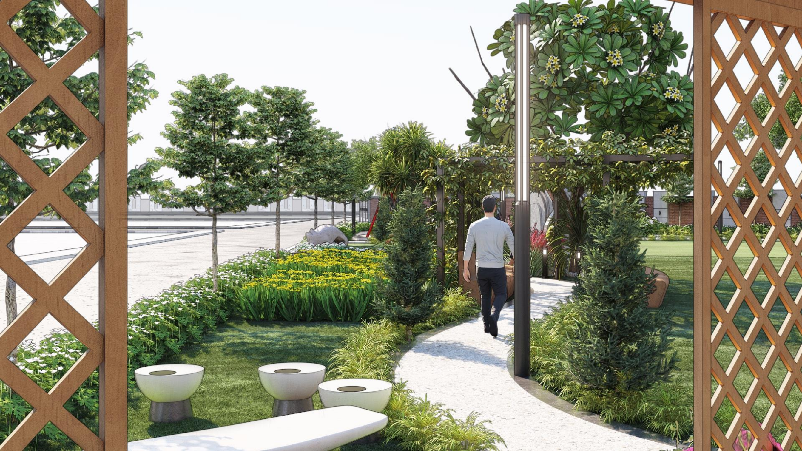
GARDEN 1 VIEW 7