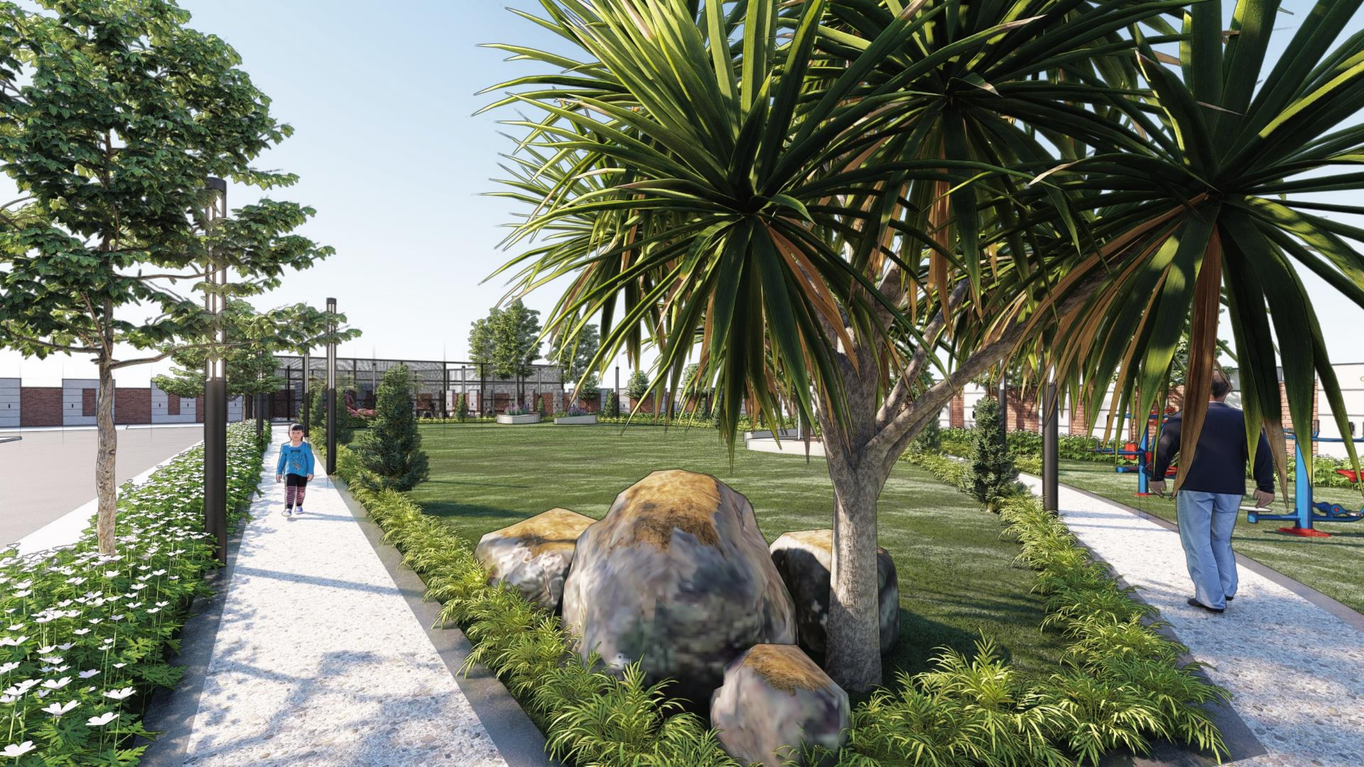
GARDEN 2 VIEW 5