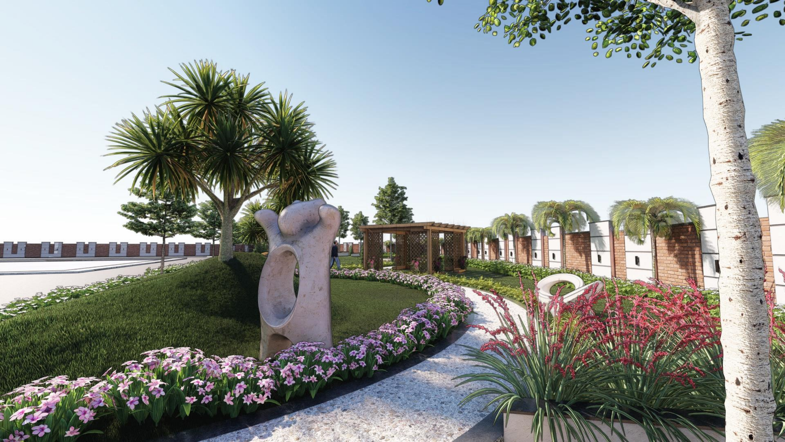
GARDEN 2 VIEW 3