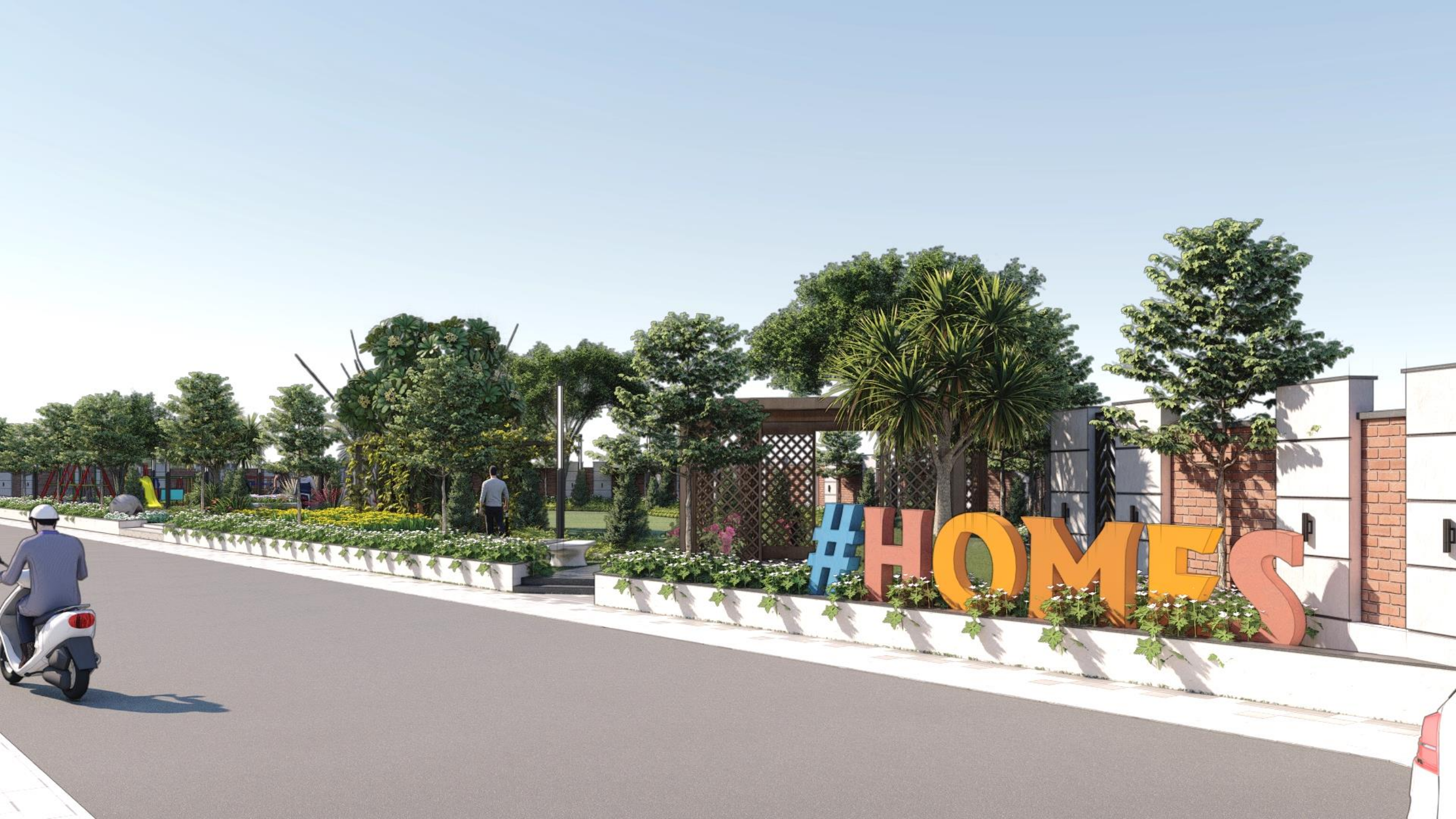
GARDEN 1 (AS SEEN FROM ROAD)