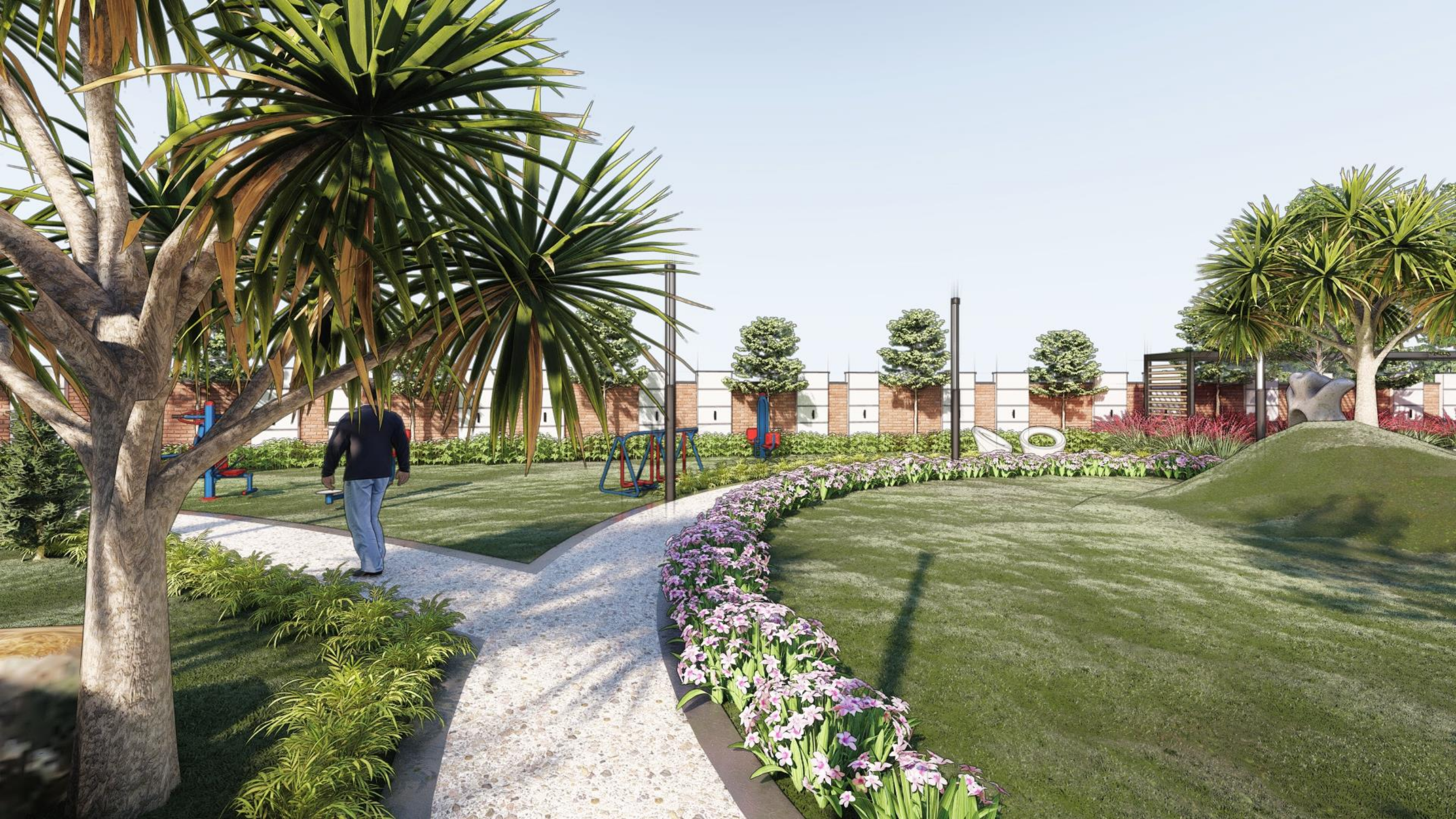
GARDEN 2 VIEW 7