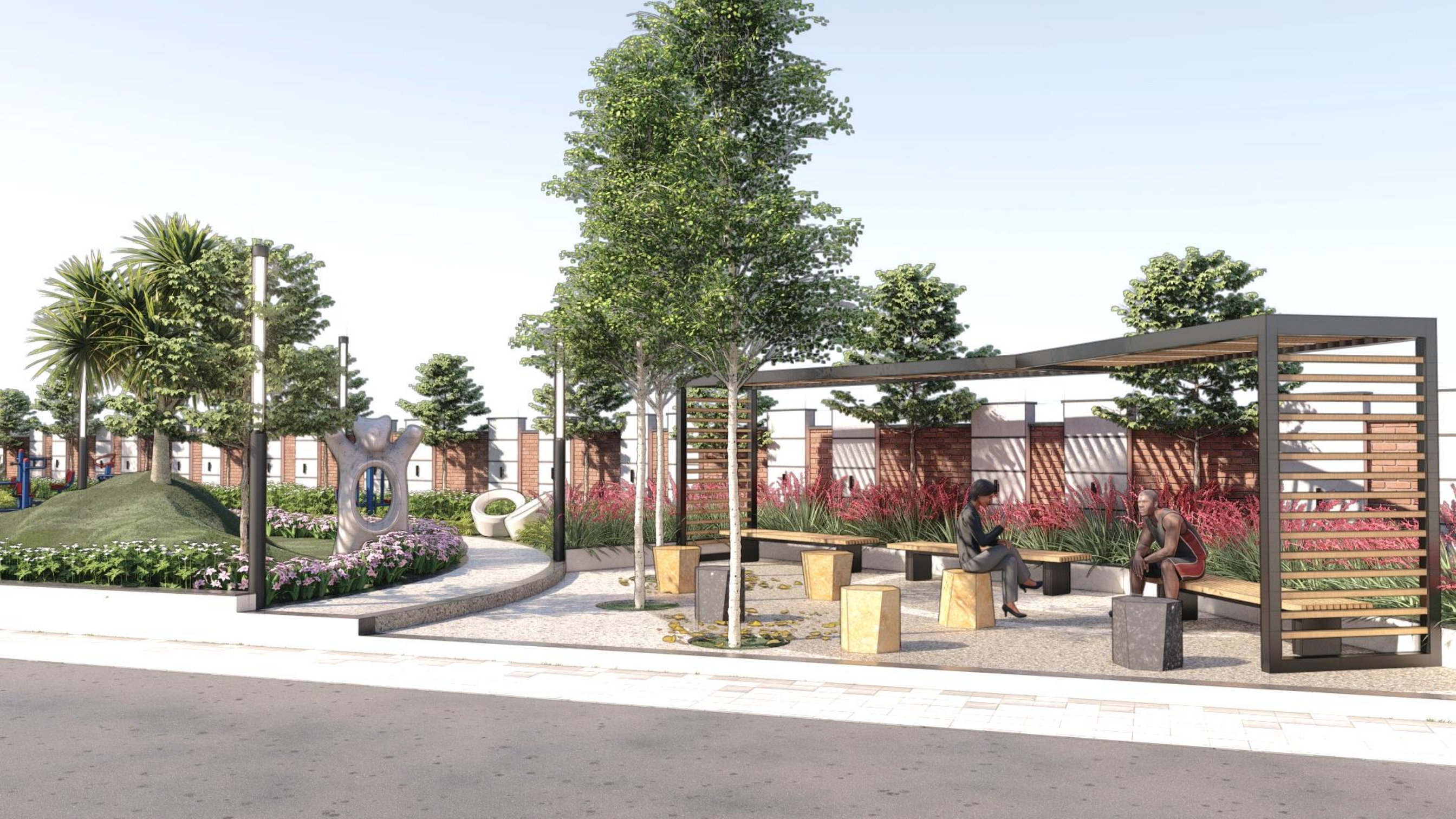
GARDEN 2 VIEW 2 (INFORMAL SEATING)