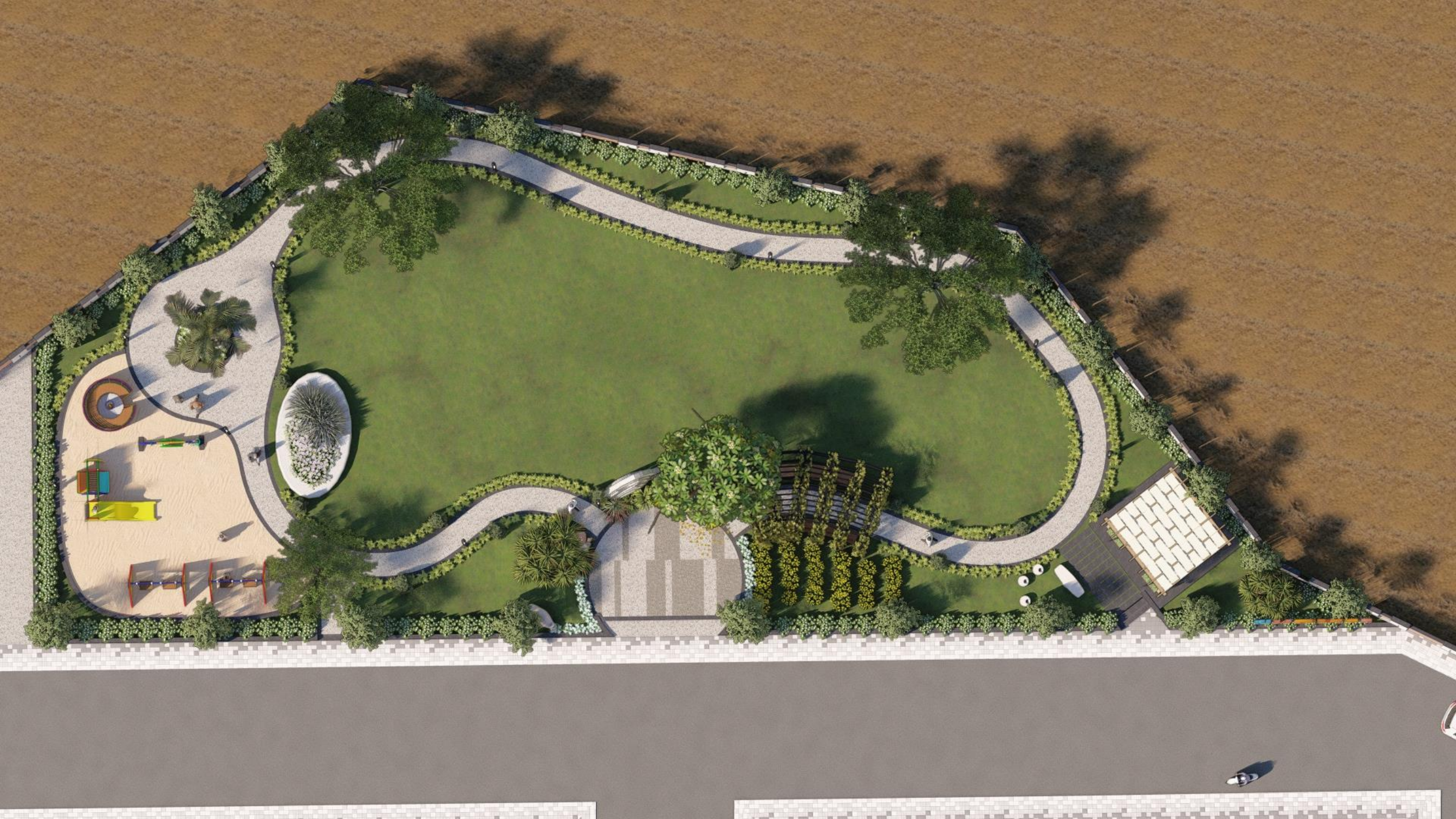
GARDEN 1 PLAN